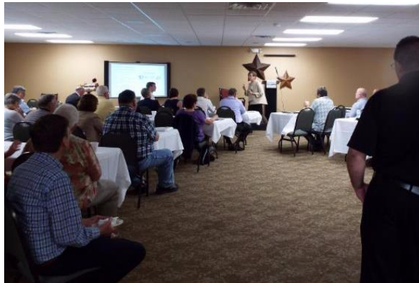
Photo taken at the Fall 2014 Regional Development Summit.

Our state - despite citizens' well-founded concerns about Illinois' future - remains among the top of the pack when it comes to economic performance and quality of life. At this year's Regional Development Summit, Blackhawk Hills Regional Council will feature what's worth celebrating in the Land of Lincoln, as well as issues with which policy makers, organization leaders, and local elected officials must contend.