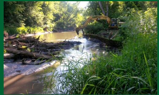
Logjam clearing on the Plum River.