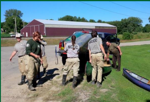
AmeriCorps team helping with clean-up.

Preparations are now being made for the public cleanup coming on Saturday, September 19th. See http://www.carrollcountyswcd.com/plum-river.html for information on how to participate in the cleanup and future efforts or call the Carroll County SWCD at 815-244-8732x3.