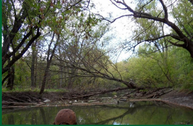
Steel barrel and other debris stuck in tree in Plum River near Savanna, IL.

At its last board meeting, Blackhawk Hills Regional Council agreed to help the Carroll County Soil and Water Conservation District (SWCD) plan a clean-up of the Plum River to improve accessibility to boat traffic and to beautify the river. The project will open ten miles of the Plum River to paddle sport enthusiasts and fishermen. Long-range goals include creating a water trail on the Plum River with several access, while improving aesthetic quality, alleviating some flooding, preserving fishery habitat, and improving timber along the river.