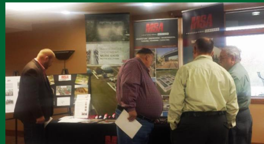
Summit participants had an opportunity to visit exhibitors.