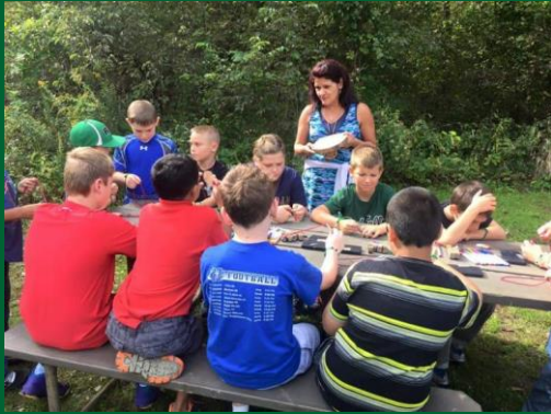
Students listening to wood cookie decorating instructions.

On October 6 and 7, 2015, Outdoor Stewardship Days were held at Lowell Park in Dixon, Illinois. About 1,000 third-graders from Lee and Ogle Counties participated in the event. At Stewardship Days, students traveled between 22 stations learning about the water cycle, conservation law enforcement, forestry and wildlife habitats, among other topics. The Soil and Water Conservation Districts of Lee and Ogle Counties organized the event. Blackhawk Hills' staff volunteered in the Activity Tent.