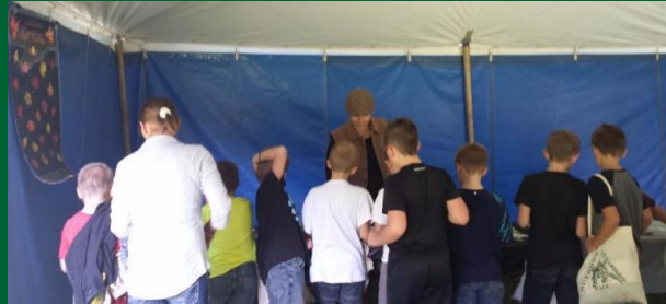
Students identifying animal tracks in the Activity Tent.