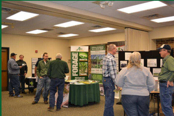
Participants at the Grazing Conference were able to visit with exhibitors.

Blackhawk Hills was one of the sponsors of the Northwest Illinois Grazing Conference. The event was held on March 2, 2016. There were 36 participants. The program featured five speakers and covered various topics, including: Transitioning from Winter Feed to Summer Grazing, Who Manages Forage on Your Spread, Forage Options for Better Grazing, Economic Perspectives of Transition and Forage Management Options, Grazing and Water Quality: More Compatible than Portrayed, and Lessons Learn in Contract Grazing and Niche Marketing.