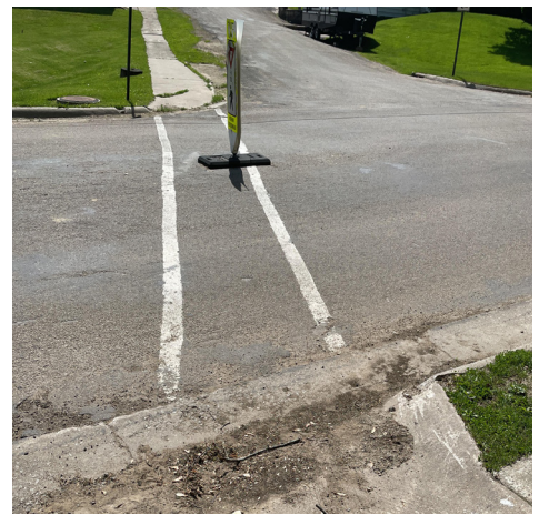
An intersection and crossing near a school assessed by BHRC staff

...Oregon (Ogle Co), Sterling (Whiteside Co), and Warren (Jo Daviess Co). Another area of pandemic response includes addressing quality of life issues more intensely, such as the availability of affordable, high-quality single and multi-family workforce housing. In early 2021, Blackhawk Hills and partners (e.g., economic development organizations, main street entities, workforce and housing agencies, local units of government, etc.) concluded an extensive request for proposals process, selecting Redevelopment Resources (based in Madison, WI) to study the state of housing and related investment opportunities in each of our counties. Other components of livability - such as recreation, public health, and multi-modal mobility - will be addressed in county greenways and trails planning, a process initiated by BHRC staff. In addition, we will continue engagement with government stakeholders concerning the state's Local CURE program and the recently enacted federal American Rescue Plan. Staff support in 2020 was behind some of our smallest communities' participation in Local CURE and businesses' pursuit of aid via various financial assistance programs.