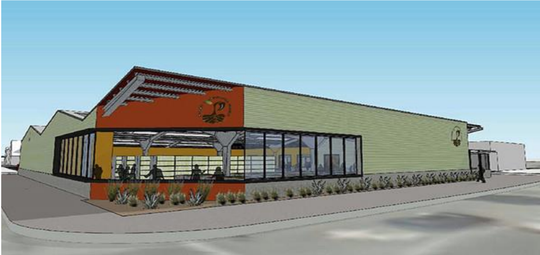
DeKalb County Community Health Education and Food (CHEF) Center